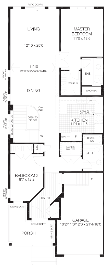
OPT. GROUND FLOOR

End unit, optional two bedroom layout. Over $16K in upgrades including upgraded 3 x 5 acrylic shower in ensuite, oak hardwood flooring in kitchen & quartz countertops in kitchen & bathrooms. Design Centre bonus included in price.