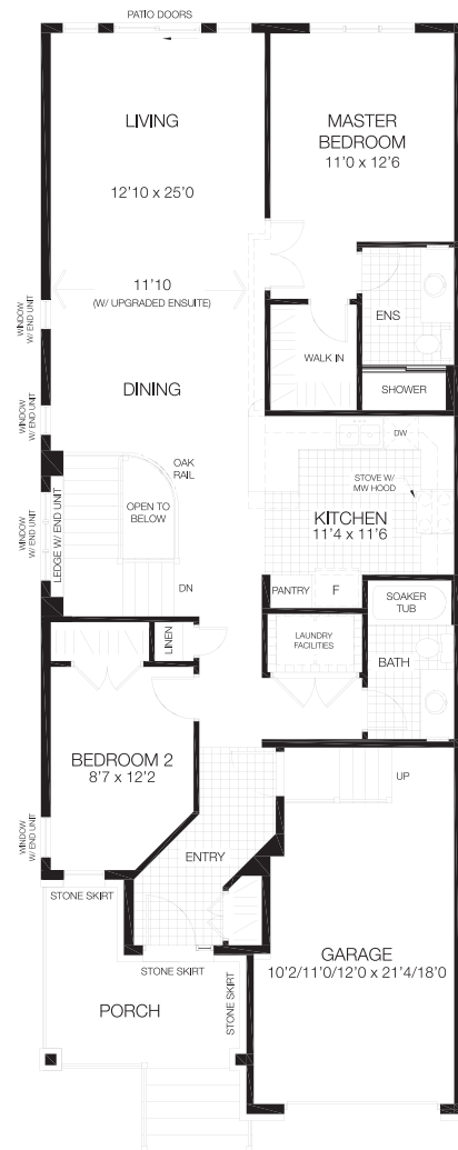
OPT. GROUND FLOOR

End unit, optional two bedroom layout. Over $16K in upgrades including upgraded 3 x 5 acrylic shower in ensuite, oak hardwood flooring in kitchen & quartz countertops in kitchen & bathrooms. Design Centre bonus included in price.