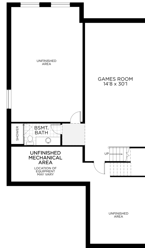
BASEMENT - FINISHED AREA 525 SQ.FT.